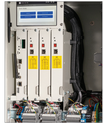
Location of maximum 3 x add-on cards

*** Time Response (typical): % of value after 1 measurement cycle.